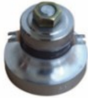
BJC-25(40)/50T -64HS PZT-8