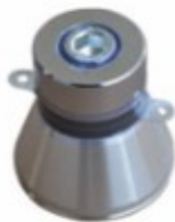
BJC-25100T -68HS PZT-4