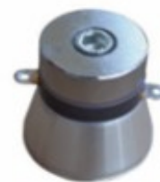
BJC-28100T -68HS PZT-4