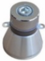
BJC-2560T -59HS PZT-4