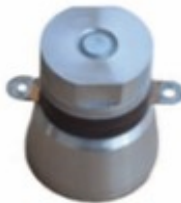
BJC-4060T -48SS PZT-4