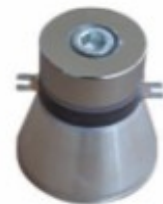
BJC-28120T -68HS PZT-4