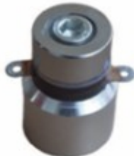
BJC-6860T -49SS PZT-8