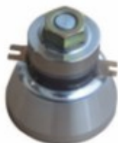
BJC-5435T -38HN PZT-4