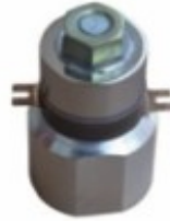
BJC-2850T -45SS PZT-4