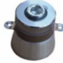
BJC-4060T -49HN PZT-8