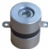
BJC-12060T -40SS PZT-4