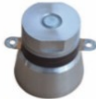
BJC-4060T -48SS PZT-4