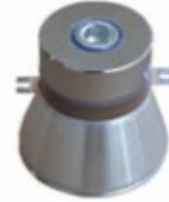
BJC-2860T -59HS PZT-8