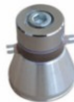
BJC-28100T -68HN PZT-8