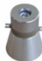
BJC-20100T -68HN PZT-8